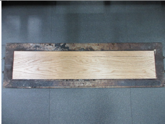
Before test- Radiant heat source