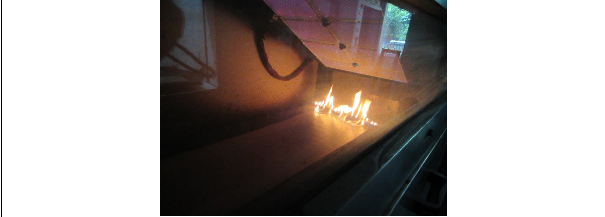
During test- Radiant heat source