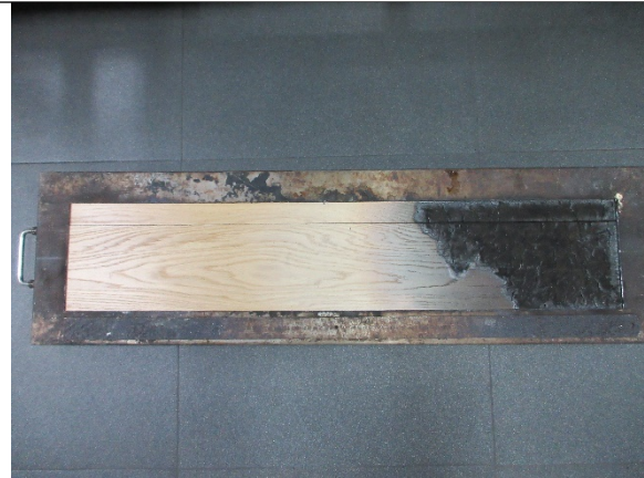
After test- Radiant heat source