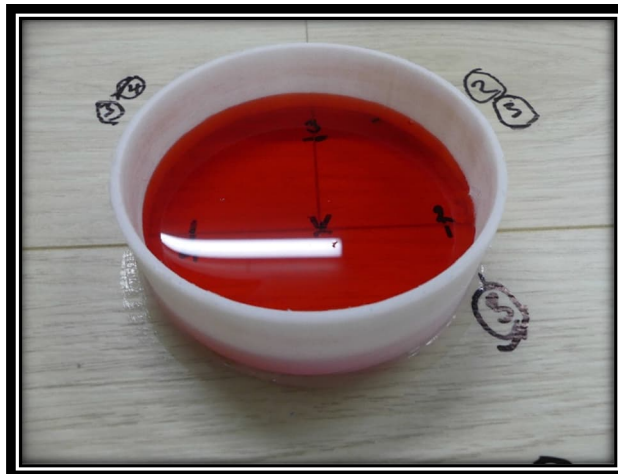
After 24 hrs With Water